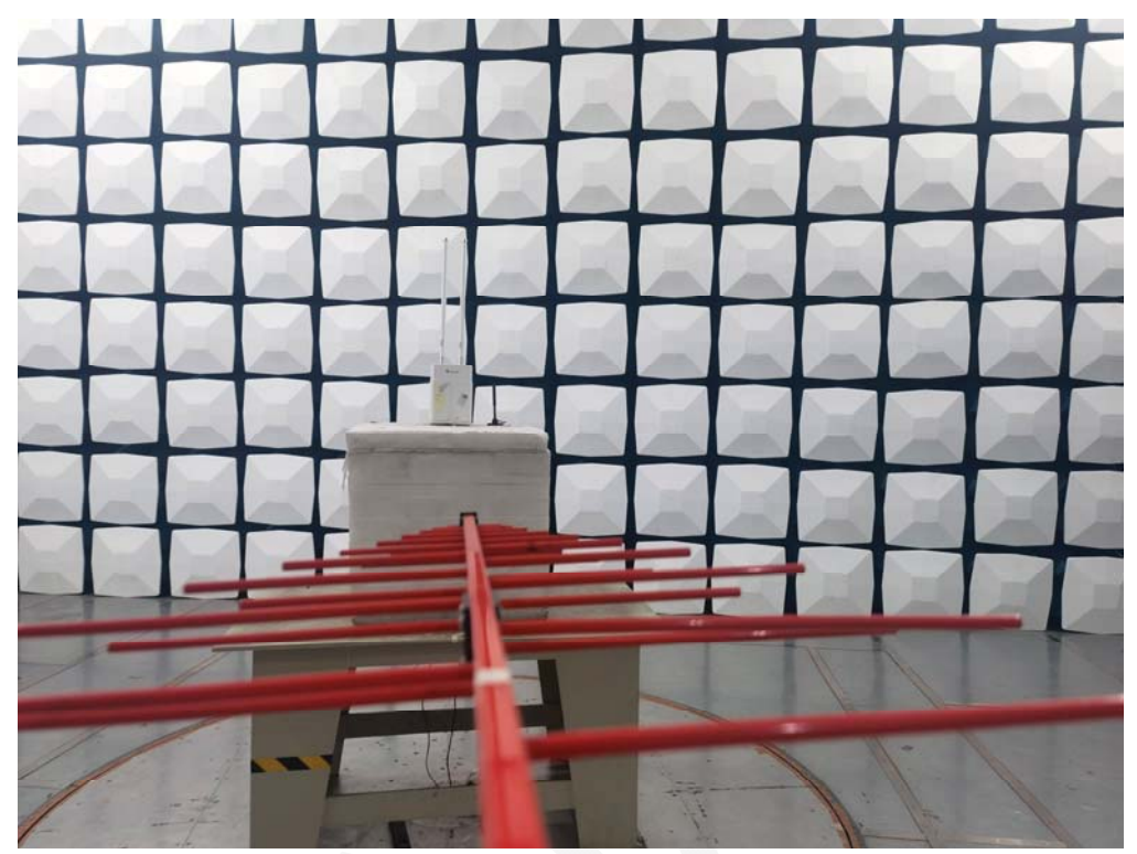
RE Above 1GHz View