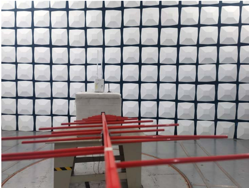
RE Above 1GHz